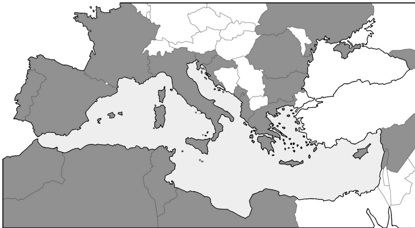
Fig. 2. ACCOBAMS Agreement Area and contracting parties.