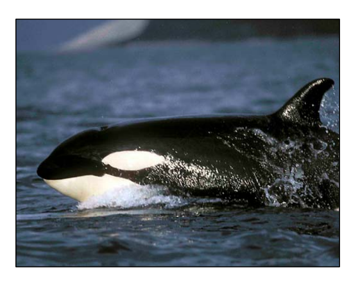
Killer whale Orcinus orca

Although killer whales are rare, there has been an increase in sightings since systematic recording began in 1989. In winter, the species is closely associated with the mackerel purse-seine fishery, and has been frequently observed 80-150 km offshore north of Shetland. At other times, it is widely distributed in nearshore waters around Sumburgh Head, Mousa, Noss, Yell and Bluemull Sounds. Coastal sightings generally occur between April-September, with group sizes ranging from 1-12 animals, but usually 6 or less.