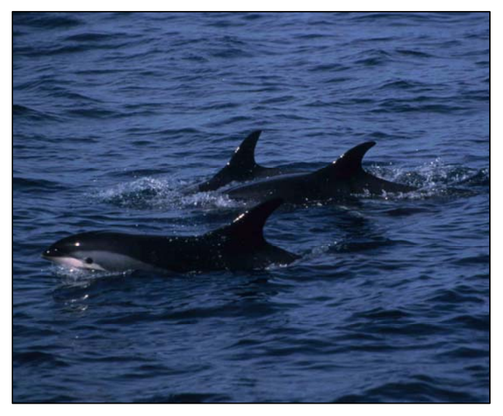
Atlantic White-sided dolphin Lagenorhynchus acutus

The Atlantic white-sided dolphin is a pelagic, deep-water species occurring mainly along the continental shelf edge north and west of Shetland. Nevertheless, the species is widespread in nearshore waters where it is mainly observed between Sumburgh Head and Fair Isle, and along the east coast of mainland Shetland. Coastal sightings peak between June and October, particularly August. The species is generally seen in large herds that can number up to 1,000 individuals.