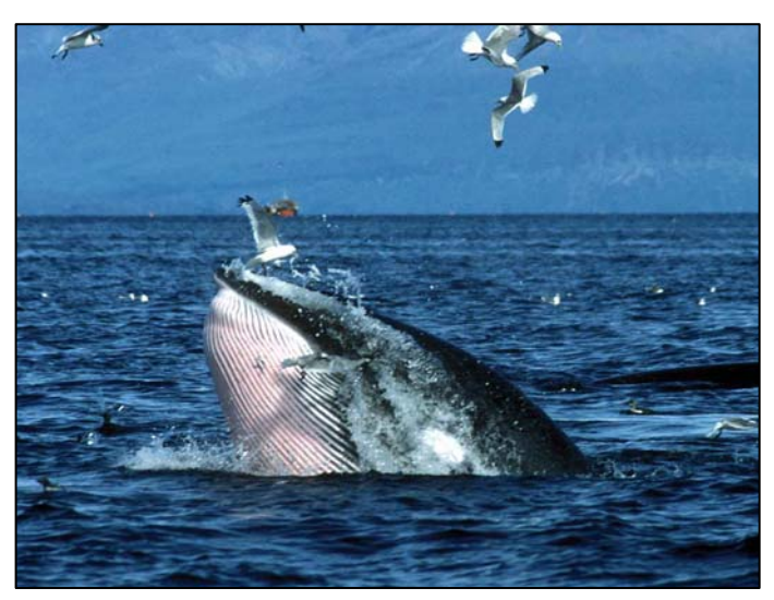
Minke whale Balaenoptera acutorostrata

The minke whale is the most commonly sighted whale in Shetland waters. It has a widespread distribution, with most sightings occurring between July-September, particularly off the east coast. The species is seen singly or in groups of up to 15 animals.