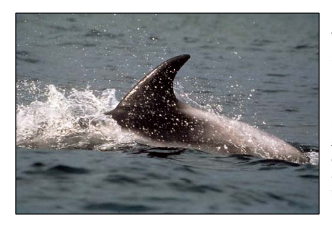
White-beaked dolphin Lagenorhynchus albirostris

White-beaked dolphins are widespread and common in inshore waters, particularly on the east coast and between Sumburgh Head and Fair Isle, although the species occasionally enters the voes at Whiteness and Clift Sound near Scalloway. The white-beaked dolphin can be sighted throughout the year with numbers peaking between July and September.