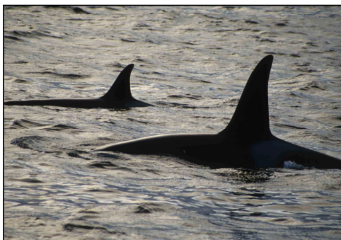
Killer whale Orcinus orca

The killer whale is widely distributed throughout Orkney waters, occurring in all months of the year, but with peak frequency of nearshore sightings between June and October. Although sightings of the species are fairly infrequent, individuals and groups of 2-10 whales have been reported particularly around Pentland Firth, the Scapa Flow and the North Isles. Closely associated with purse seine fishing activities, pods of up to 150 killer whales have been observed in the North Sea east of Orkney.