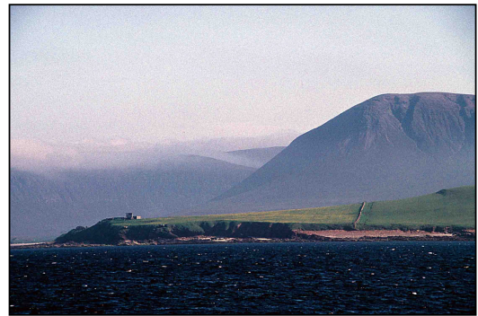
Hoy Sound, Orkney