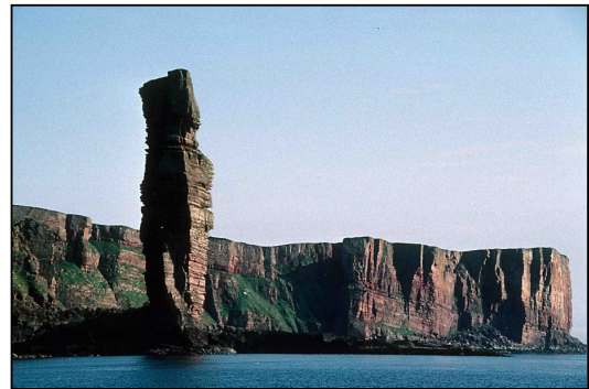
Old Man of Hoy, Orkney