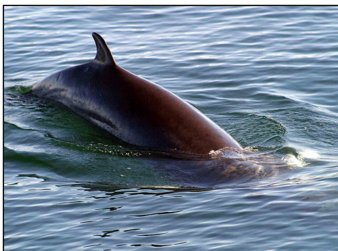
Minke whale Balaenoptera acutorostrata

The minke whale is the most frequently observed baleen whale species in the region. Most observations have been made along the west and south coasts of Orkney and in the Pentland Firth, but this may reflect the better cliff vantage points available there. The species is widely distributed in small numbers, with most sightings (singles or groups of up to ten) occurring between June and October.